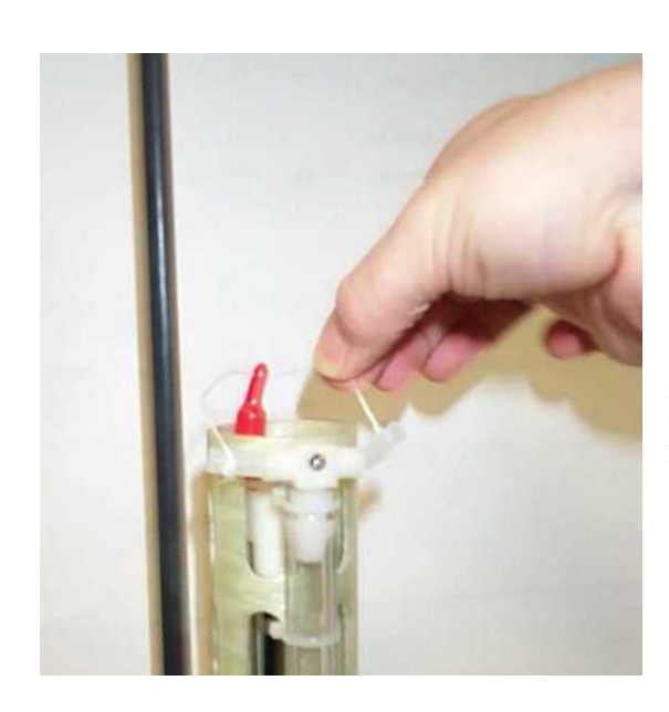
IMPORTANT: Remove plastic bag and three plugs from CTD sensor , if they have not already been removed.