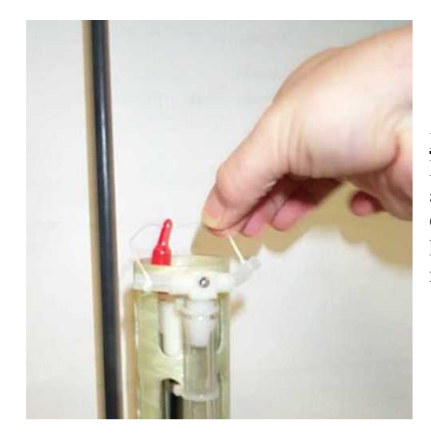
IMPORTANT: Remove plastic bag and three plugs from CTD sensor, if they have not already been removed.