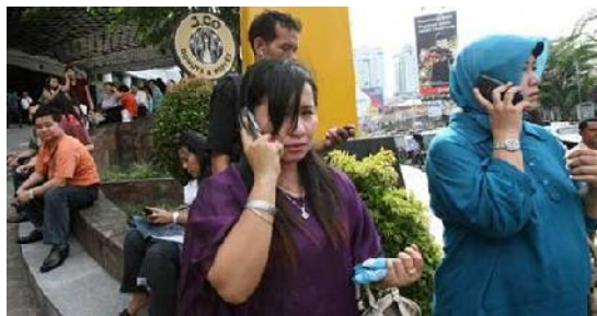
Indonesian women outside a shopping mall in Medan, Sumatra island, Indonesia, after being evacuated.