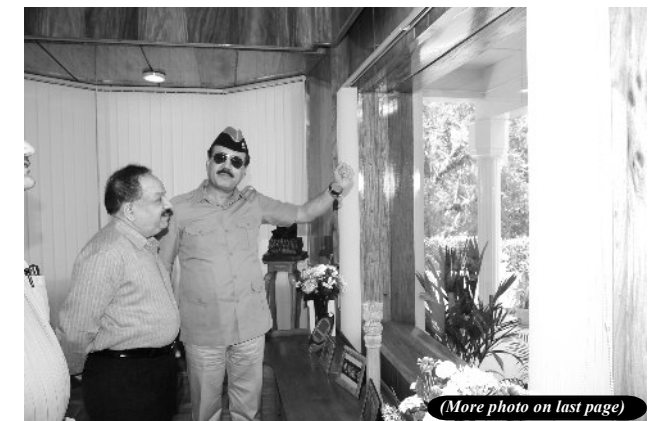
(More photo on last page)

these Islands lie in Seismic Zone 5 and that the setting up of such Laboratory is going to be immensely beneficial to the Islands. The Lt. Governor also lauded the efforts of the Indian National Centre for Ocean Information Science (INCOIS), Hyderabad for their frequent updates and early warnings on natural disaster such as earthquake, cyclones etc. The Lt. Governor also urged the Union Minister to help the Island Administration to set up a Desalination Plant at Mayabunder or Chowra on a pilot project basis in order to