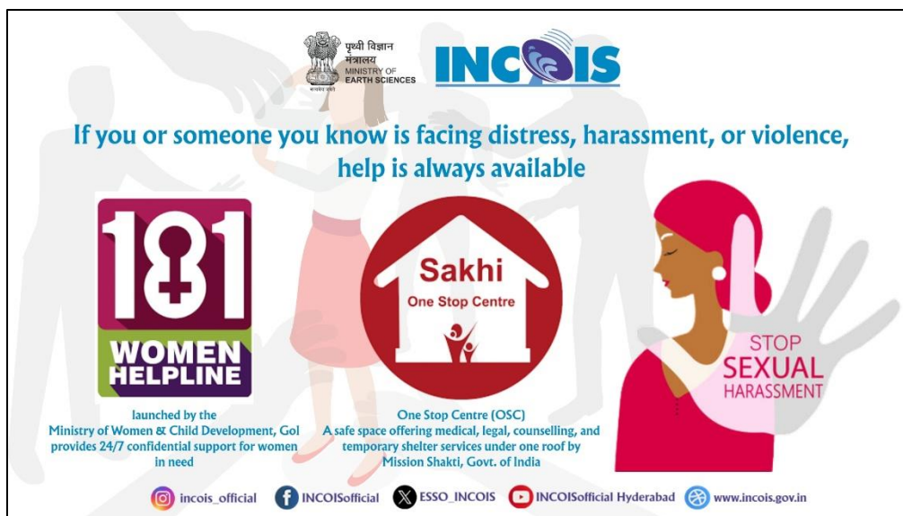
Fig 2: Posters designed and published in social media for creating awareness on women helpline and OSC